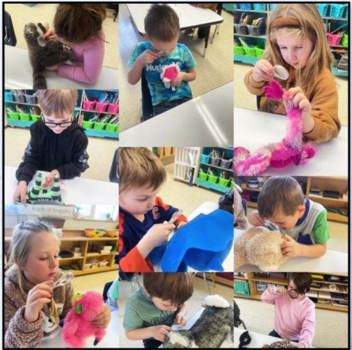
The Grade 1s have been investigating properties! Students have used balance scales, magnifying glasses and non-standard measurement to describe and compare objects!