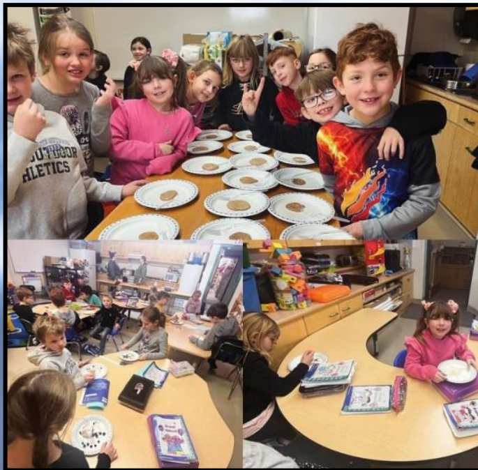
The grade three class wrapped up their Peru unit and celebrated with a fun cultural party.