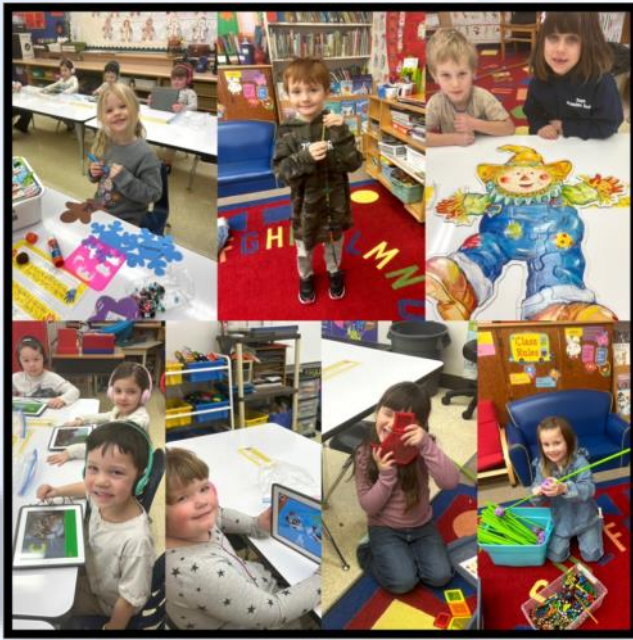
The Kindergarten students are having an awesome time building, creating, learning and discovering in centers.